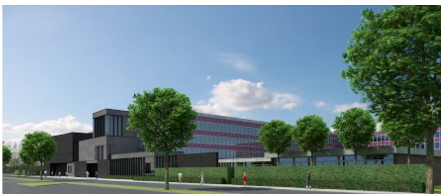
2013 EUROGEO conference venue, Bruges, Belgium