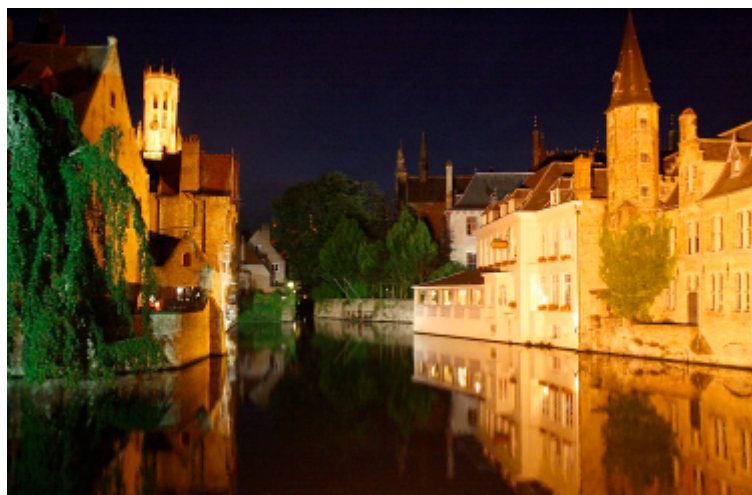
Central Bruges: location of EUROGEO 2013

Details will shortly be available on the EUROGEO Web site: http://www.eurogeography.eu