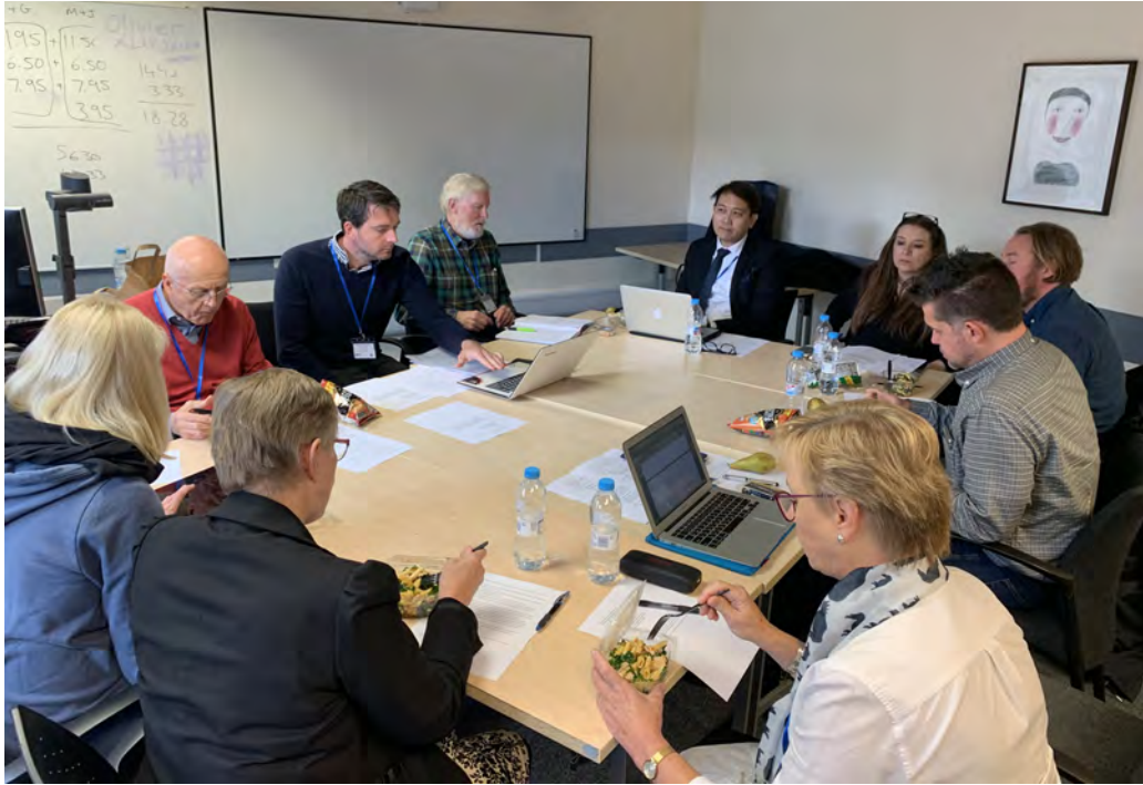
Steering Committee meeting during the second day of the conference; the Steering Committee shared progress made since the last meeting and agreed on further actions where necessary.